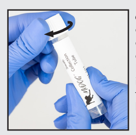
6. Screw the cap securely onto the swab collection tube. Ensure the tube is sealed tightly to prevent leakage.