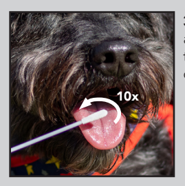
3A. Swab up and down dog's tongue 10x to collect sample.