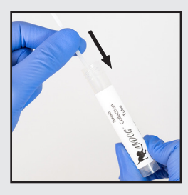
4. Place swab head with sample directly into the solution at the bottom of the swab collection tube.

Use one swab collection kit for each collection site.