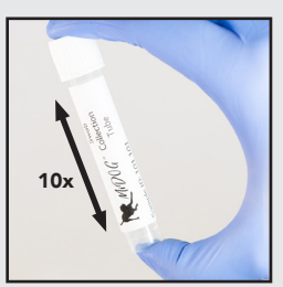
7. Shake the swab collection tube 10 times to fully cover the swab with solution.