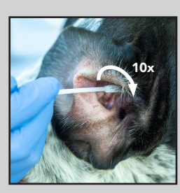
3D. Carefully twirl the swab in the ear canal, pressing gently against sides. Twirl 10 times. Remove without contacting the skin.

Use one swab collection kit for each collection site.