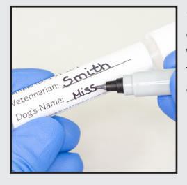
1. Label swab collection tube with the name of the veterinarian and the dog.