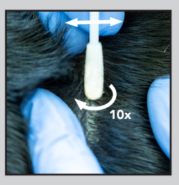
3C. Press the swab directly onto the skin. Maintain moderate pressure while moving/twirling the swab in the area 10 times.