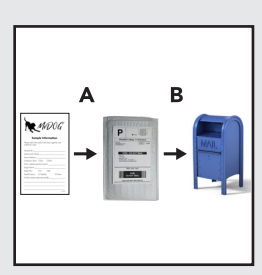
9. (A) Fill out the MiDOG<sup>™</sup> Sample Information Sheet and add to prepaid envelope. (B) Mail the package via U.S. Postal Service within 1

year of sample collection. Your MiDOG™ Report will be sent to the email address you provide within 5 business days after the sample is received.